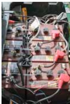
Battery maintenance is eased by systems that make topping up the electrolyte pretty much fool proof; worth specifying if not offered as standard. Modern batteries are far more resilient too, with a well-proven history in the golf sector.

“With the ability to tackle more demanding terrain, the electric Cushman Hauler 1200X has extra ground clearance and more suspension travel. A limited slip rear diff helps traction in slippery going too”