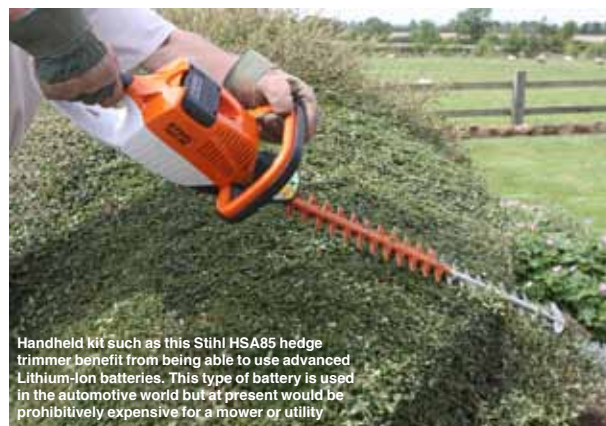
Handheld kit such as this Stihl HSA85 hedge trimmer benefit from being able to use advanced Lithium-Ion batteries. This type of battery is used in the automotive world but at present would be prohibitively expensive for a mower or utility

charge on the go may have a shortened life span.