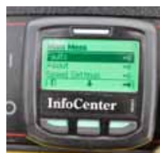
With battery power comes more advanced control and fault-finding options. Both the Toro eFlex and Jacobsen Eclipse pedestrian mowers can be set up to operate in a certain way, a great help when you seek consistent mowing over every green.

Adding that these issues, along with tilt testing a panel equipped mower, has led to cautious approval of just one panel at present. But the approval comes with a caveat that suggests its use can compromise the life of the batteries; deep cycle batteries subjected to