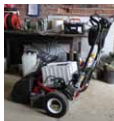
Courses not geared up for electric mowing may look to buying a walk behind as an initial step. All you need is a charger and somewhere to plug it in. It is only when you really work with battery power that you will know if it suits your needs.