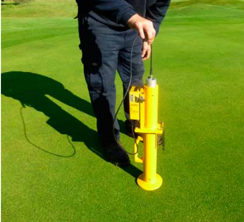
firmer and more consistent for longer periods of the year".