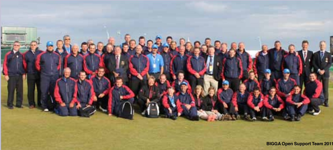
BIGGA Open Support Team 2011