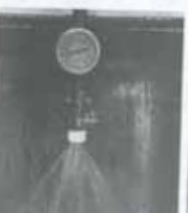
A worn nozzle, resulting in incorrect spray application.

Full technical specifications for the type 119, as well as the standard types 116 and 99, are available from AF Tranchers, Greenbeck Road, Colchester, Essex CO1 9JL. Tel: 0206 44411.