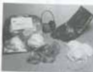
The Supaturf safety pack.

Supaturf has introduced a safety pack for spray operators. It contains protective gloves, goggles and mask, all conforming to British Safety Standards, and retails at £21.99.