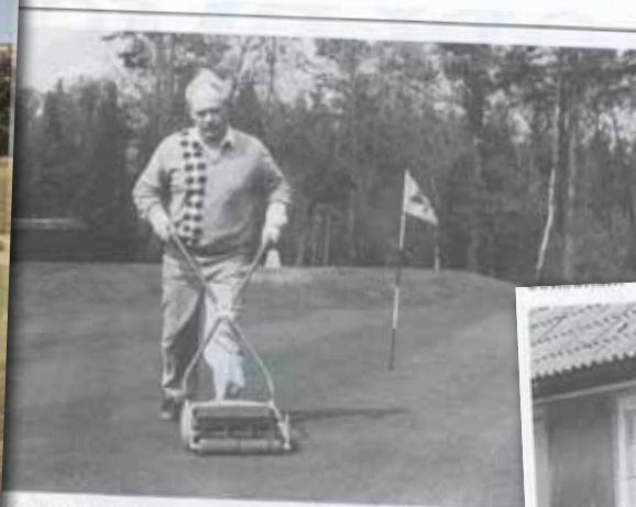
Jack gets to grips with a Sunningdale green.

... long as we are allowed to aerate, compensating for the additional traffic. Somehow we must find a way to carry out aeration programmes without disturbing the golfer. A very experienced greenkeeper knows that a well-aerated soil aerates well with little evidence of the work having been carried out. The real problem lies in very compacted soils where aerators