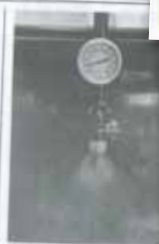
A Sarmach nozzle with spray pattern uniformity.

The spreader features double stainless steel rotors, enabling it to handle fertilizers of any chemical constitution. A new wheel drive system provides efficient and quiet operation. Its spread control is obtained by adjustments to the discharge helix, rather than by varying the rotation speed, and the efficient spread pattern eliminates the danger of