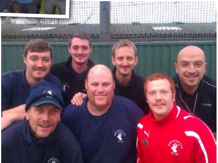
ABOVE: the Roehampton Club