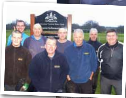
ABOVE: Buchanan Castle GC after and INSET LEFT before Movember