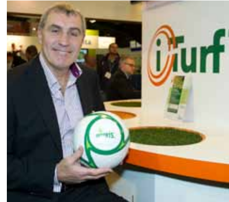
Legendary English goalkeeper, Peter Shilton was kept busy on the Everris Stand on Tuesday, signing footballs for visitors and posing for pictures