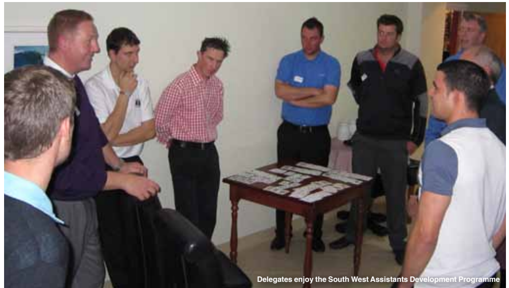
Delegates enjoy the South West Assistants Development Programme

ISSN: 0961-6977 © 2012 British and International Golf Greenkeepers Association Limited