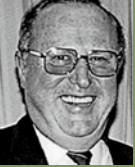
BIGGA President Sir Michael Bonallack, OBE