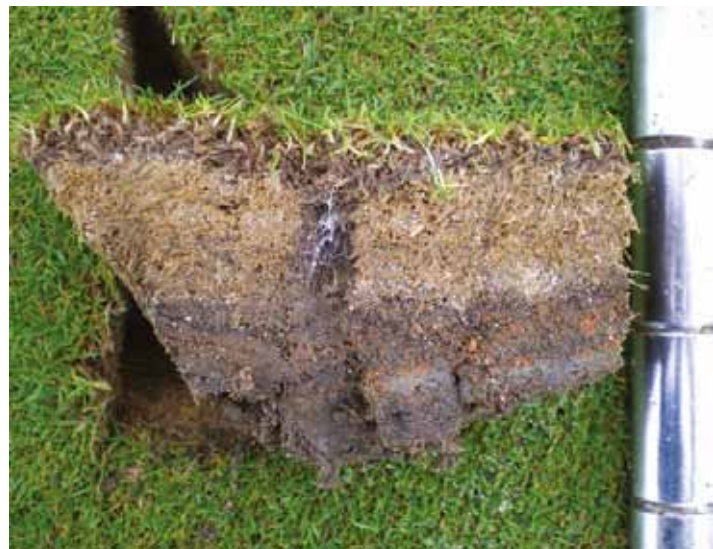
ABOVE: Thatch should be regularly maintained through mechanical means along with top dressing, which will help dilute the organic matter layer.

But change is good. Remember, If we keep doing what we're doing, we're going to keep getting what we're getting.