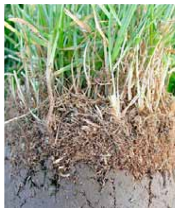
LEFT: In low maintenance turf, thatch build-up occurs at a significant rate over a growing season. However, some thatch is good as it provides protection against moisture evaporation and resilience to wear and tear.