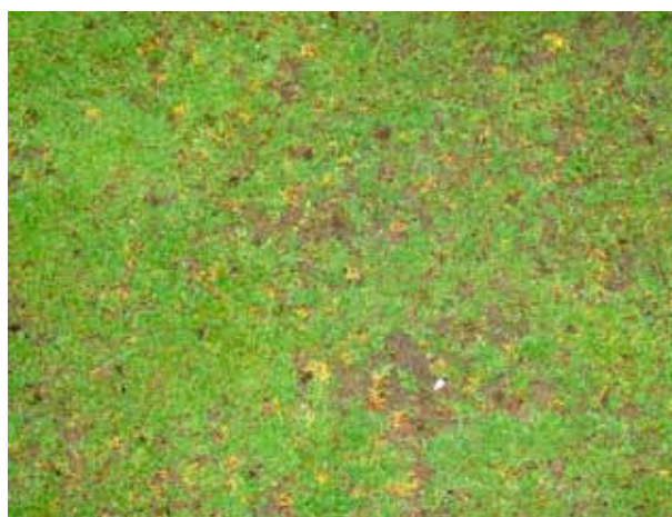
ABOVE TOP: Thatch development in soils close up INSET ABOVE: Anthracnose in action

Generally speaking failure to remove grass clippings during mowing will encourage the build-up of thatch especially if the clippings are long. Leaving very short clippings on the turf is less of a problem, the argument being that any addition to the thatch layer by what is an ultra- fine biomass with a large surface area is essentially neutralised and compensated for by the promotion of thatch decomposing bacteria. They feed on the clippings to produce soluble nutrients which is a valuable natural resource fed back into the turf. Naturally fed turf is healthy and resilient turf and clearly requires less synthetic fertiliser and fewer applications of fungicide and insecticide.