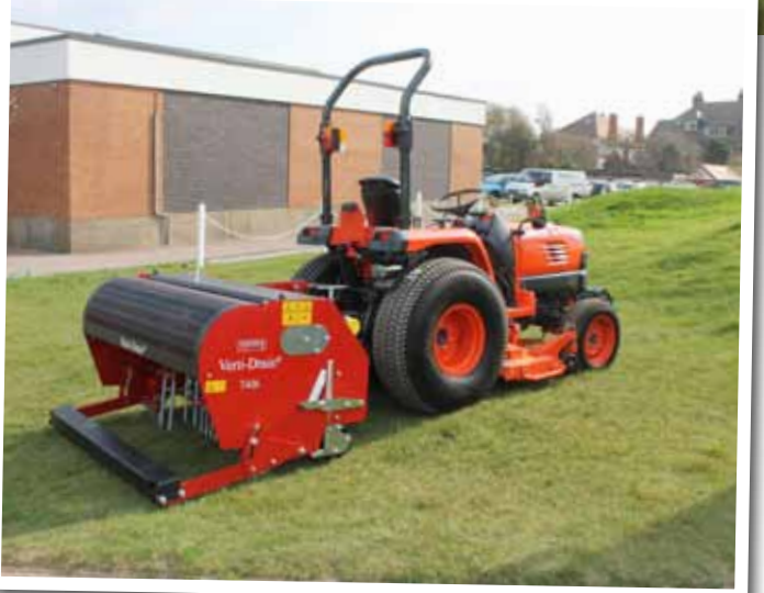
The BIGGA National Championship sponsors' were a great partnership

The 2012 BIGGA National Championship will be held at Irvine Bogside Golf Club, Ayrshire, on October 8 & 9, 2012.