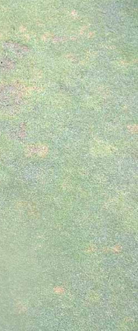
Anthracnose damage on a green high in Poa (Poa annua var annua)