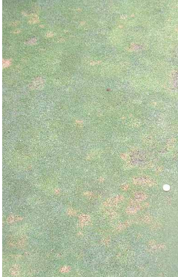
Greens are now at risk of anthracnose for most of the year, not just in late autumn and through to spring

turf disease rankings has resulted in a re-assessment of measures required to avoid, manage and control anthracnose including use of fungicides.