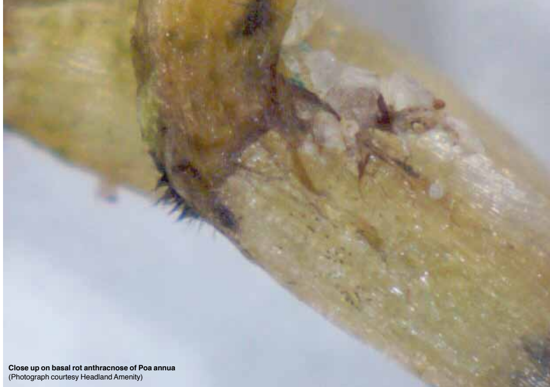
Close up on basal rot anthracnose of Poa annua