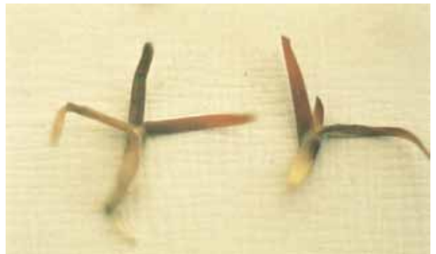
Detached tillers of Poa annua showing dark coloured basal rot due to anthracnose