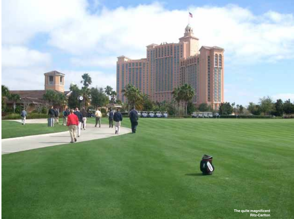
The quite magnificent Ritz-Carlton

friends and colleagues from across the world – a thoroughly enjoyable evening which was completed with a few games of pool, table tennis and an opportunity to show the locals how to play their own game of Cornhole – (You'll have to Google it).