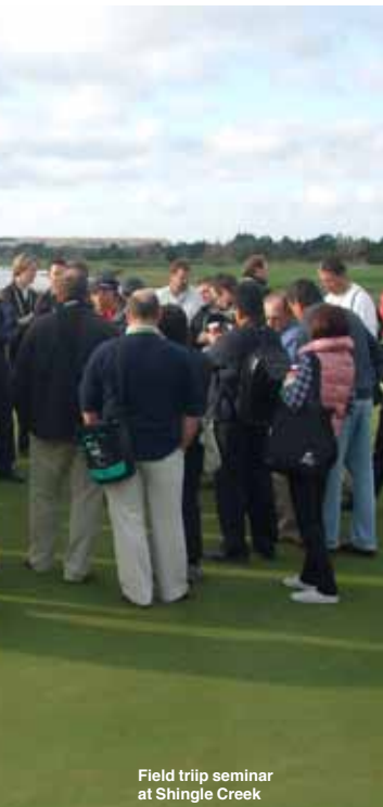
Field trip seminar at Shingle Creek