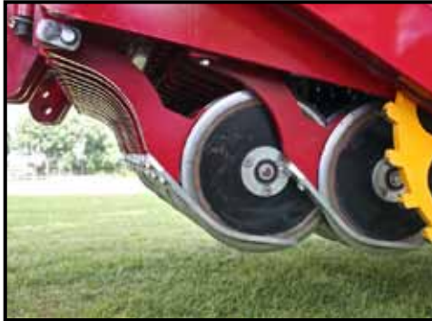
Viewed from the side, the depth of slit can be clearly gauged by the amount of disc protruding through the fingers. The toothed wheel drives the metering unit.