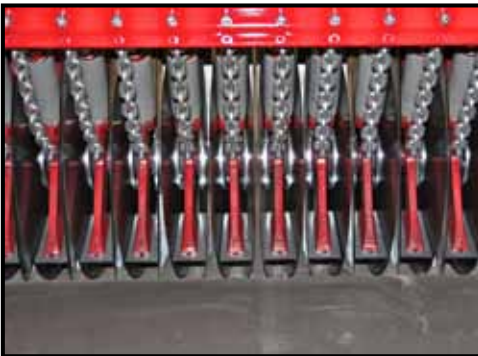
Metered seed is drip between the silt-cutting discs via tubes. Note inter-disc scrapers, the chain supports allowing the scraper to move out of the way and subsequently eject an object as the disc space opens up.