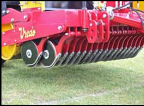
The steel flat fingers that run alongside the cutting discs help ensure a clean slice is cut into fine turf, and also help ensure an even depth is maintained across the full width of the machine.

As is so often the case, it can be dangerous to make sweeping generalisations, this applying particularly to the subject of overseeding. But when it comes to accurately placing fresh seed into an existing green, there is generally a consensus when it comes to timing; the optimum period will typically be between late August and then on through September. The job can also be carried out in October, but the later into the autumn the job is done the higher the risk of frost or late season fungal attack.