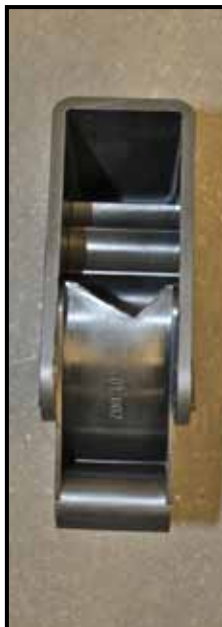
The flutes of the metering unit are partially covered by a flap, the aperture of which is adjusted to seed the seed and desired application rate.