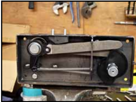
Pictured on the assembly bench at the Vredo factory, the workings of the metering drive can be seen. A key design aim is to ensure low seed rates of small seed, to include Bent grass, can be accurately maintained.

It is also fair to say there are those who prefer to overseed in conjunction with sand slitting or other aeration methods, adding seed at the same time as the sand allowing two jobs to be done at once. Others prefer a direct overseed, with an emphasis upon minimal visual impact and allowing a green to be put back into play almost as soon as the equipment leaves the green. As always there will be a play off between getting the job done and minimising disruption.