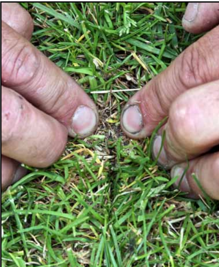
Although shown in a ryegrass winter sports turf sward, the slit cut by the seeder is 'closed' by the unit's roller. On a golf green, the slits typically only show during an early morning dew.

The Super Compact is offered in trailed and mounted versions, the build of the unit allowing the chosen model to be converted