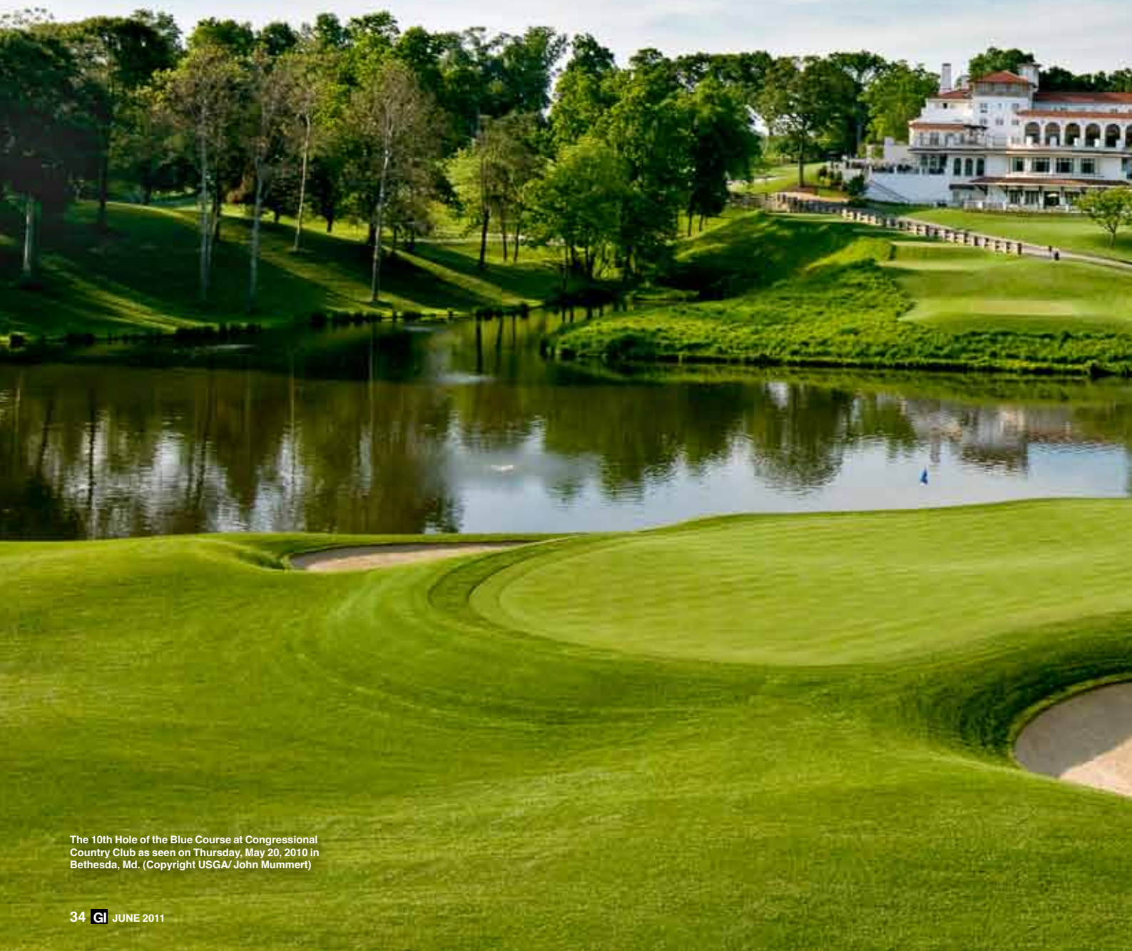
The 10th Hole of the Blue Course at Congressional Country Club as seen on Thursday, May 20, 2010 in Bethesda, Md.