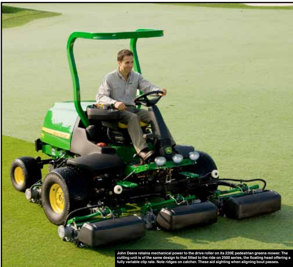
John Deere retains mechanical power to the drive roller on its 220E pedestrian greens mower. The cutting unit is of the same design to that fitted to the ride on 2500 series, the floating head offering a fully variable clip rate. Note ridges on catcher. These aid sighting when aligning bout passes.