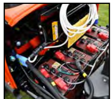
In full electric form, the Jacobsen Eclipse E322 is powered by six 8 volt batteries – two are mounted under the main pack of four - with a single point top up system making maintenance easier. A full charge should deliver 3 ¾ hours of running.

John Deere introduced its 2500E 'hybrid' ride-on greens mower in 2005 and with it helped re-kindle wider interest in the use of electric power.