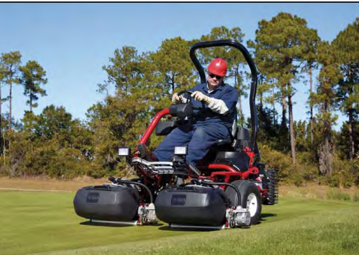
Soon to be launched in the UK, the all-new Greensmaster Triflex is to be offered in both conventional and, as pictured, hybrid forms. Pedestrian models will also be offered in hybrid and full electric variants, the latter featuring lithium-ion batteries.

But what we are seeing is real progress and development, with some interesting developments that could lead to remote mowing in the future.