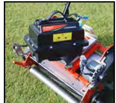
Battery powered pedestrian mowers are not new, but what has changed is the sophistication of modern units. A key emphasis is upon quality of cut, electronics enabling great precision when it comes to clip rate. Modern lead acid batteries also pack more power and staying power, reducing the risk of running out of puff half way through a job.