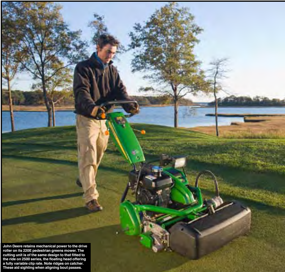
John Deere retains mechanical power to the drive roller on its 220E pedestrian greens mower. The cutting unit is of the same design to that fitted to the ride on 2500 series, the floating head offering a fully variable clip rate. Note ridges on catcher. These aid sighting when aligning bout passes.