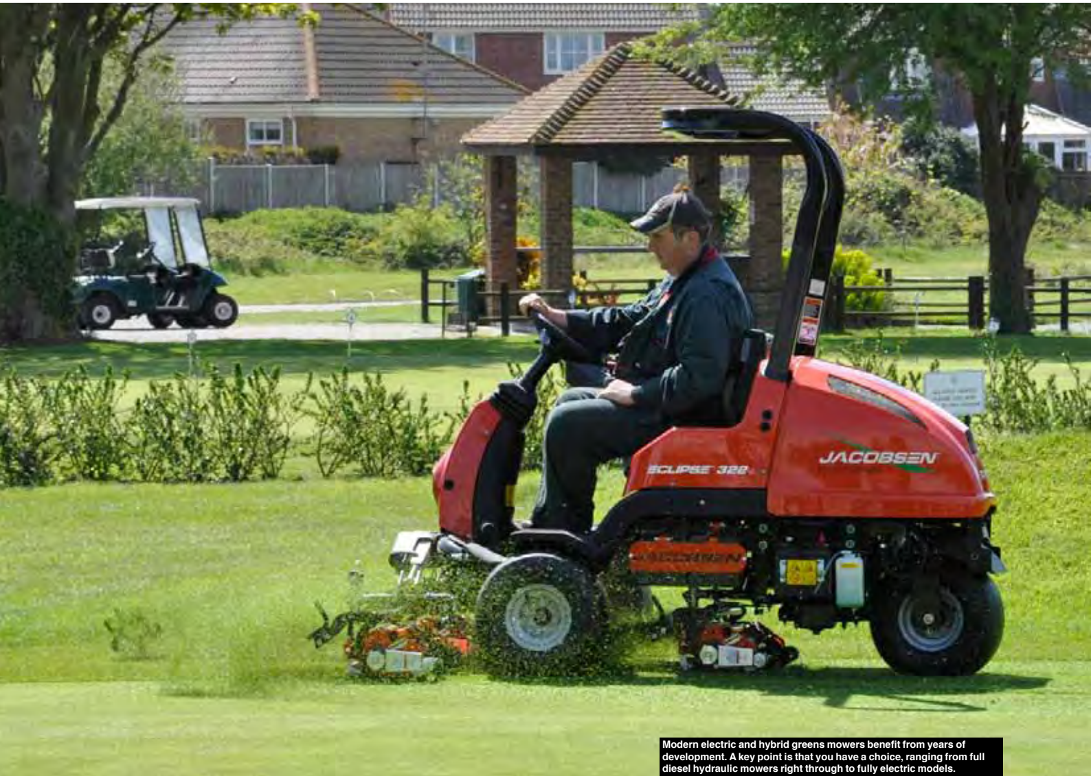
Modern electric and hybrid greens mowers benefit from years of development. A key point is that you have a choice, ranging from full diesel hydraulic mowers right through to fully electric models.