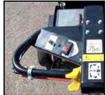
Allett has invested a great deal in making the ELMOW not just quiet and efficient but also easily fine tuned to suit conditions. The mower's controls allow the forward speed of the mower to be readily adapted to suit the operator without impacting upon the quality of cut. So operators who walk at a different pace can easily adapt the mower to suit without alerting the clip rate.