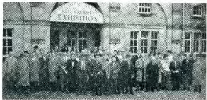
Continued and by members of the Northern and North West Sections to the S.T.P.

AGENDA —The agenda for the evening was as follows:— 1. Presentation of the Report of the Section for the year 1966. 2. Presentation of the Report of the Section for the year 1967. 3. Presentation of the Report of the Section for the year 1968.