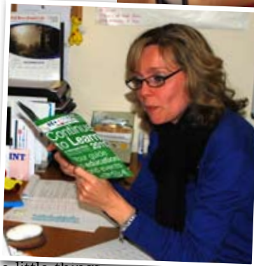
BELOW and ABOVE RIGHT: a seminar room in action and in preparation