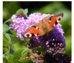
This page: more shots showing the splendour of Portmore

The Golf Environment Awards continue to promote the wide range of environmentally positive initiatives that are being undertaken throughout the golf industry and it is hoped that those clubs who are yet to address environmental sensitivities at their club will gain inspiration from the fine example set by this year's winners.