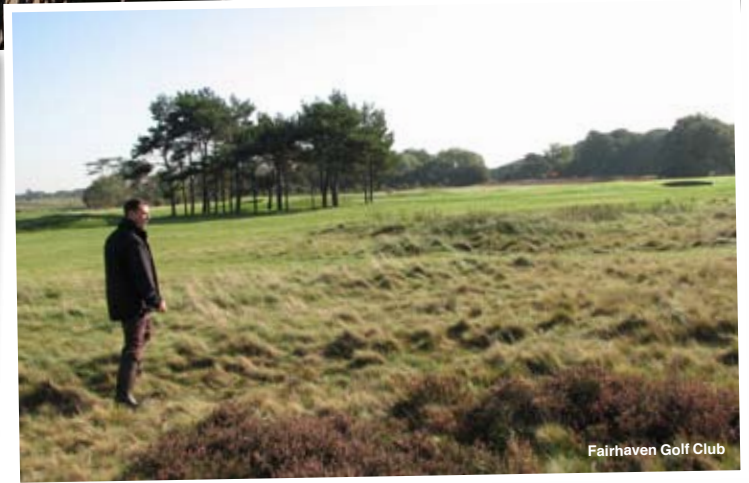
Fairhaven Golf Club