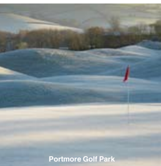
Portmore Golf Park