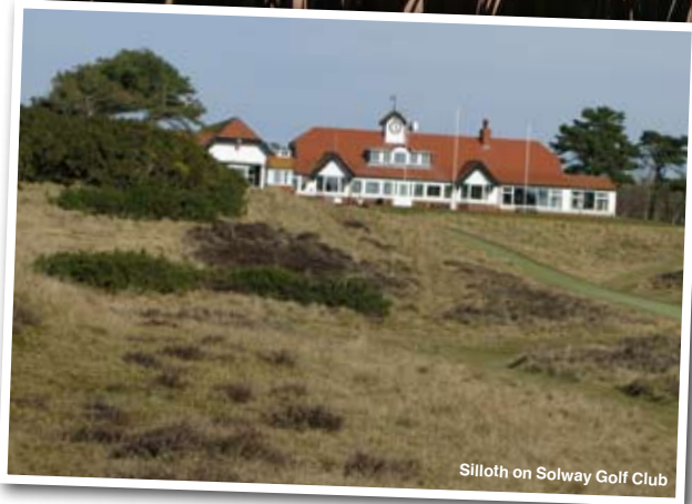
Silloth on Solway Golf Club