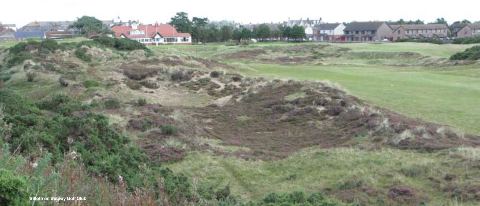
Silloth on Solway Golf Club