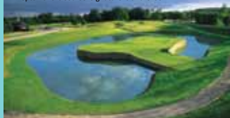
Photo courtesy of Ridding Park Repton Short Course 'Signature Island Green'.