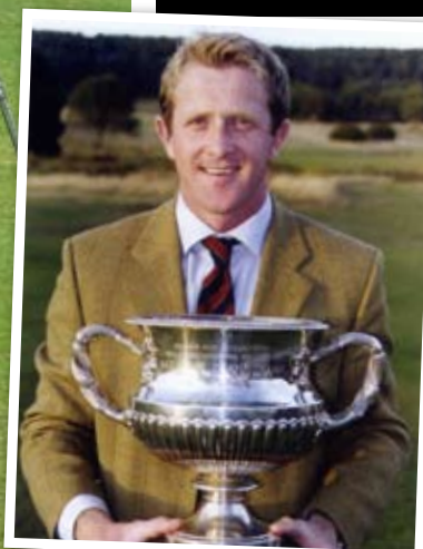
A former winner of the BIGGA National Championship, he clinched the crown at Cox Moor and Hollinwell in 2004

The holes selected during this year's tournament at The Berkshire are the par 3, 221 yard 16th on the Red Course and the par 3, 199 yard 10th on the Blue course. Any player who achieves a hole-in-one on these holes will win a car, an example of which will be on display during the tournament.