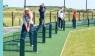
Huxley Practice Tee at St Andrews Links

Top quality practice tees, golf course tees, putting & pitching greens, pathways, patios, cart tracks and lawns professionally designed and installed.