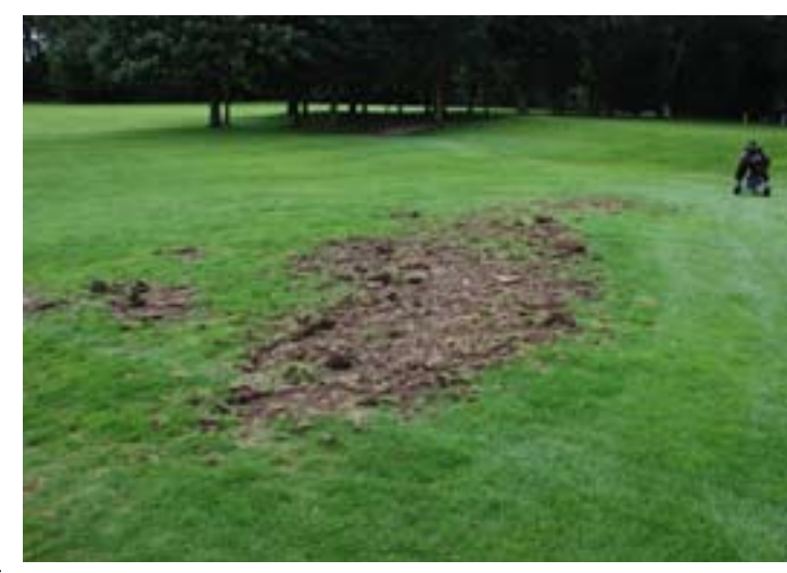
ABOVE: the consequences of badger damage and BELOW: chafer grubs

as different, however, and offers up issues that would have many greenkeepers tearing out their hair is the Horse Trials which close the golf course for nine days, every year and which can cause some fearful damage to the course. With the course closed every September Burghley members pay a 50 week of the year membership rather than