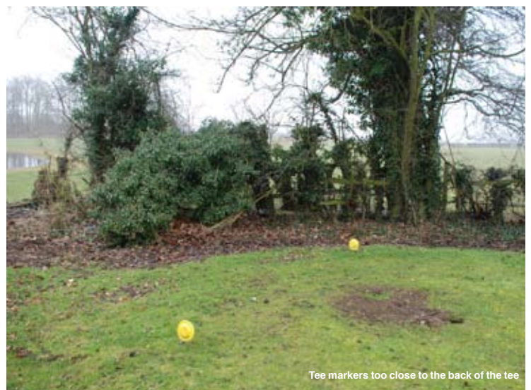
Tee markers too close to the back of the tee