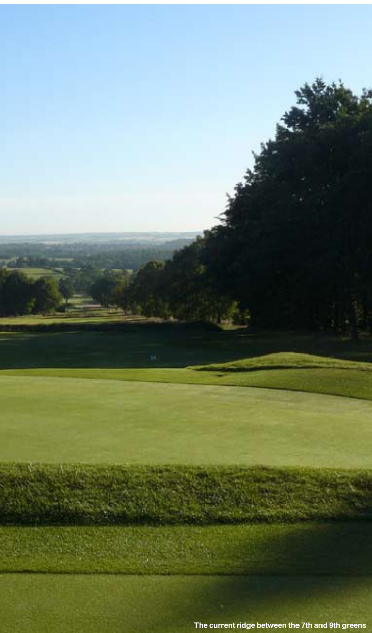
The current ridge between the 7th and 9th greens

intimidating for everyone concerned," he said.