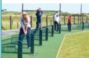
Huxley Practice Tee at St Andrews Links

Huxley Golf PREMIER ALL-WEATHER SURFACES FOR GOLF