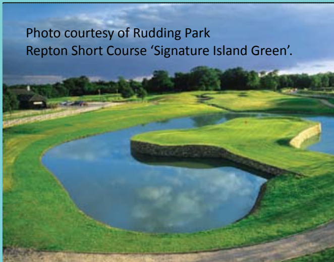
Photo courtesy of Rudding Park Repton Short Course 'Signature Island Green'.