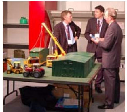
BELOW RIGHT and RIGHT: An interesting model display.