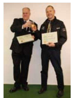
ABOVE: The Unsung Heroes