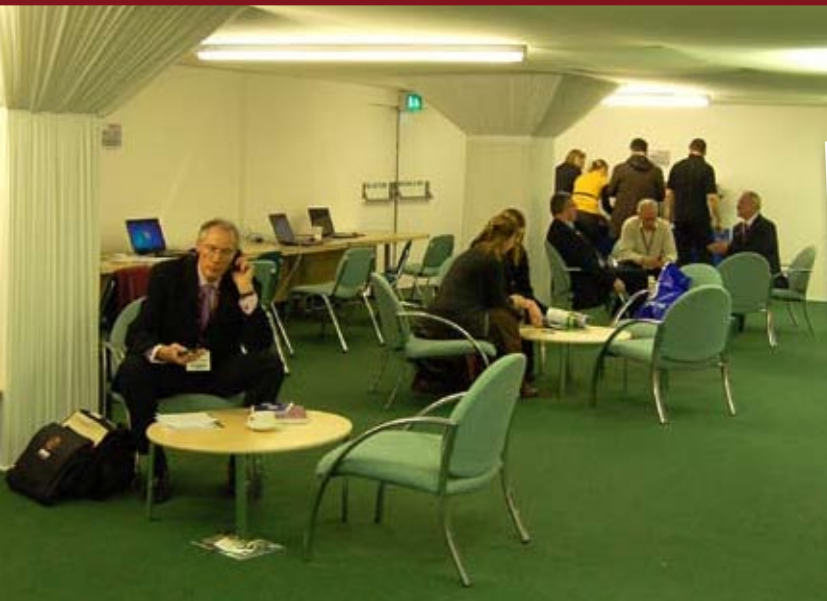
LEFT: GI Magazine provides alternate uses as shown in The Media Centre. BELOW: The Golf Ball Toilet; BOTTOM LEFT: The Casino at the Social Night; BOTTOM RIGHT: The BIGGA Stand Team