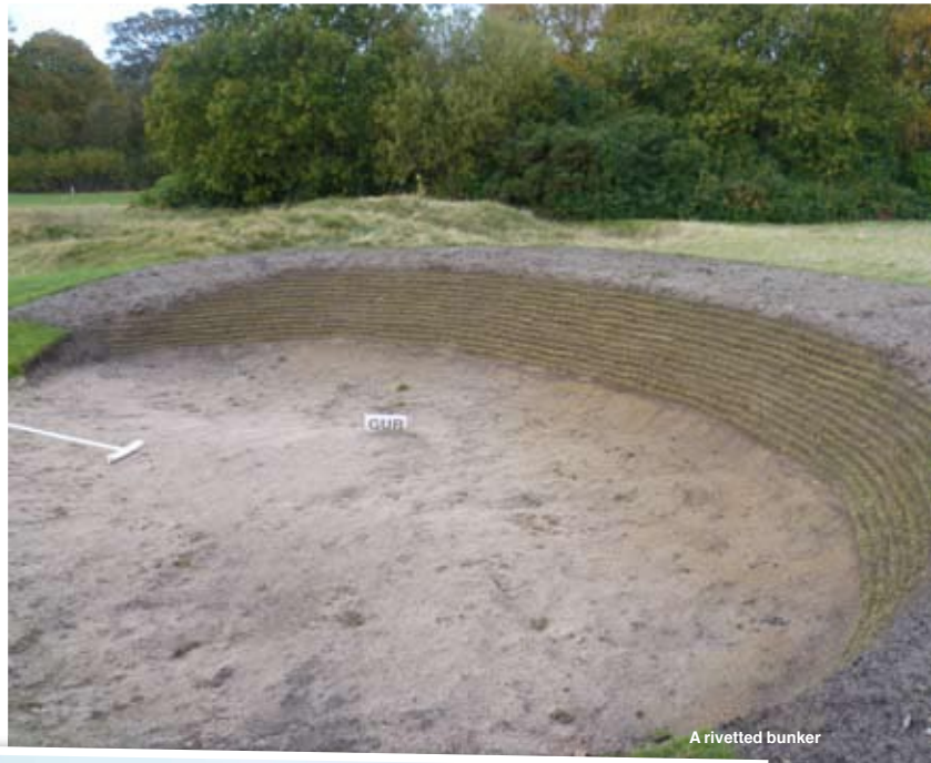
A rivetted bunker