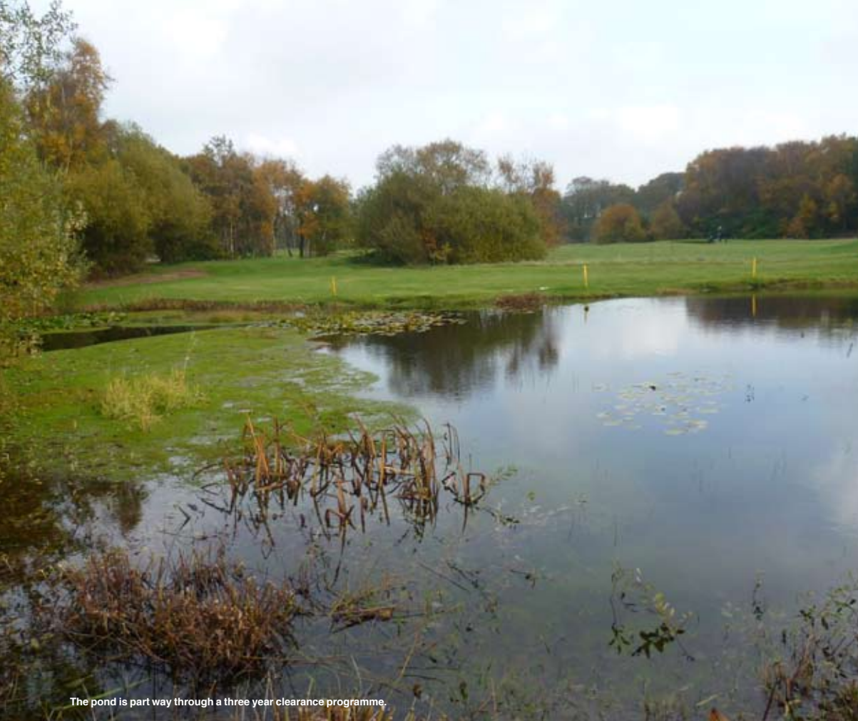
The pond is part way through a three year clearance programme.