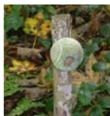
INSET ABOVE: A box for catching wildlife, and a modified tennis ball on sticks aimed at encouraging Field Mice RIGHT: The greenkeeping team

has made its home on the course which perhaps marks it out as different from most courses.