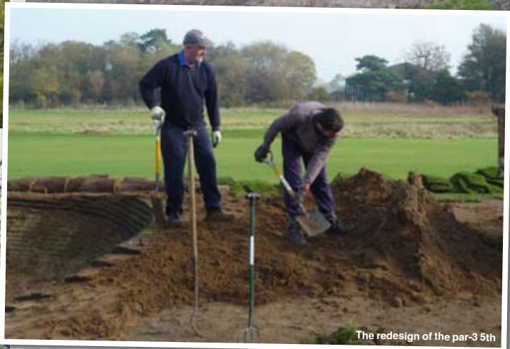
The redesign of the par-3 5th