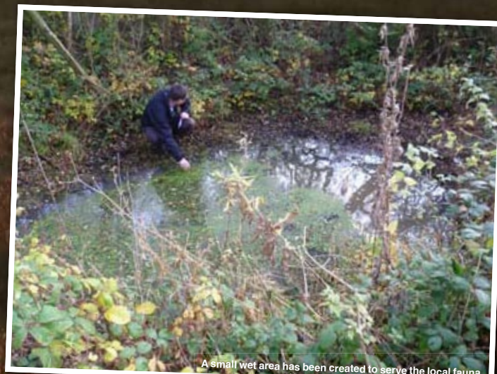
A small wet area has been created to serve the local fauna.

"Basically I started to improve my knowledge base by keeping in touch with the guys at the STRI and