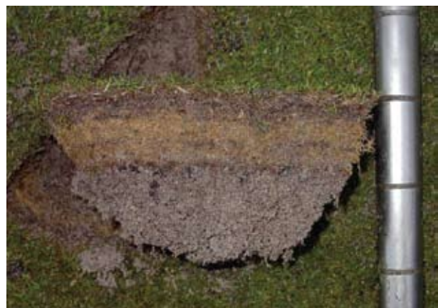
THATCH LAYER: A deep layer of thatch immediately below the putting surface in need of removal to improve turf health and playing conditions. Several years of intensive hollow coring will be necessary to remove this thatch layer and return a uniform soil profile and firm surface.