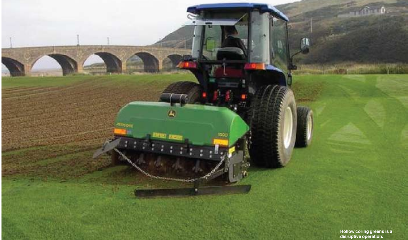
Hollow coring greens is a disruptive operation.