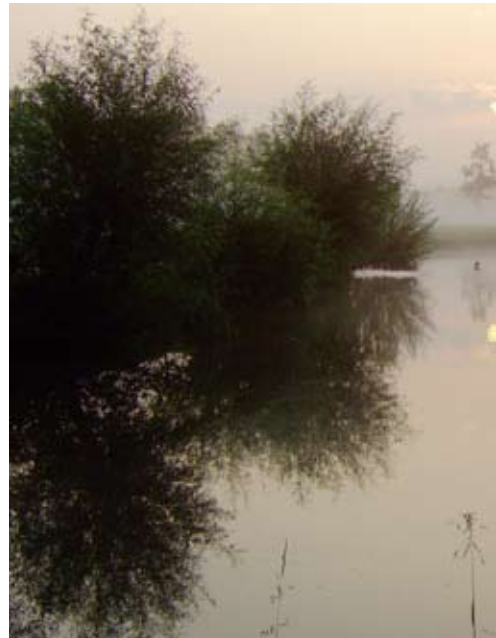
Pummerend, Burreggolf GC, Netherlands