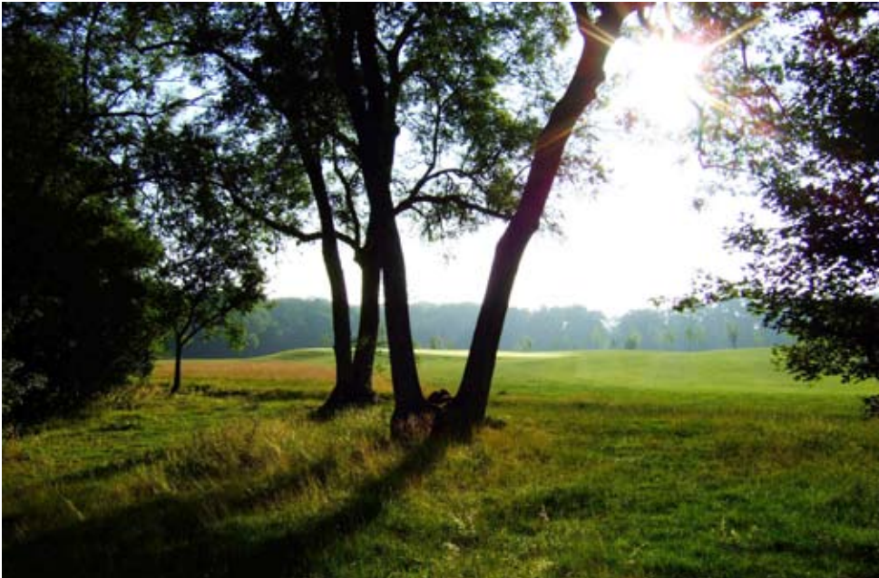
Bedfordshire GC