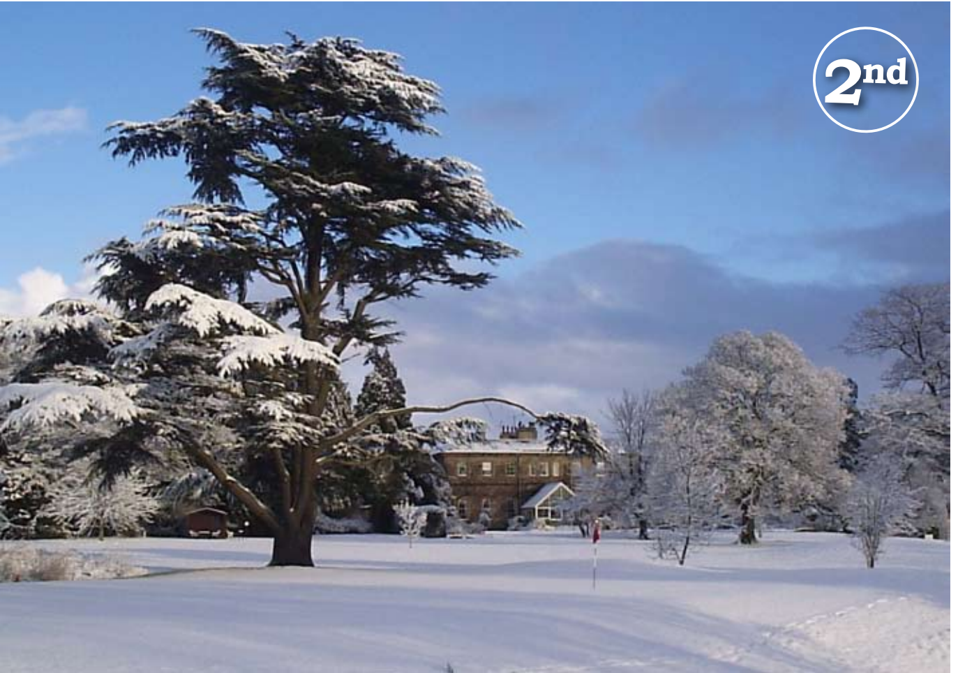
Linden Hall GC