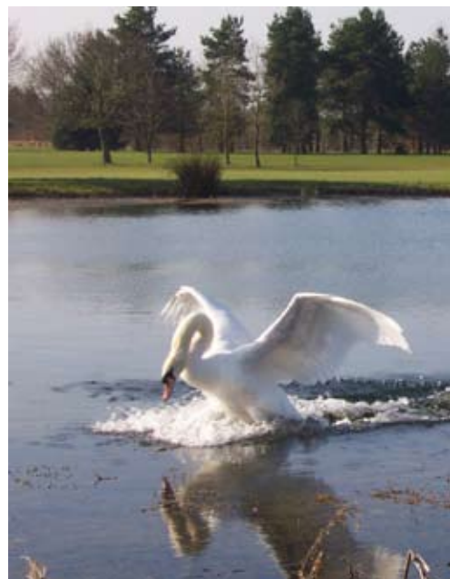
Minchinhampton GC