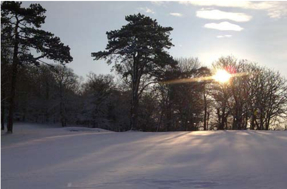
Wells GC