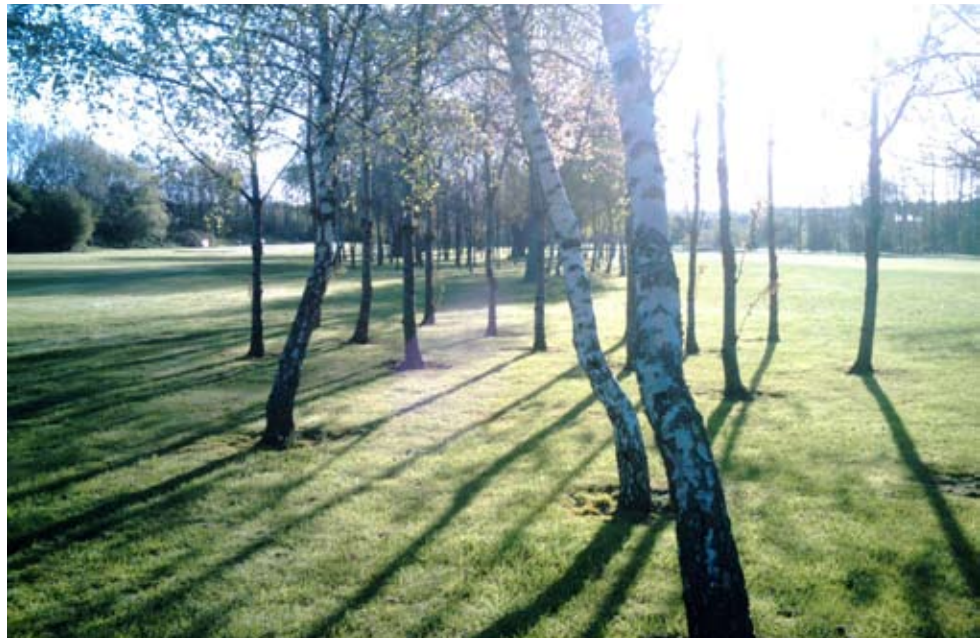
Teeside GC