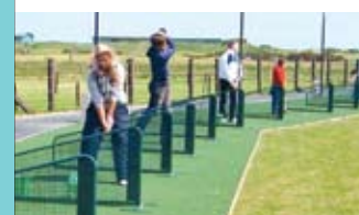
Huxley Practice Tee at St Andrews Links

Huxley Golf PREMIER ALL-WEATHER SURFACES FOR GOLF