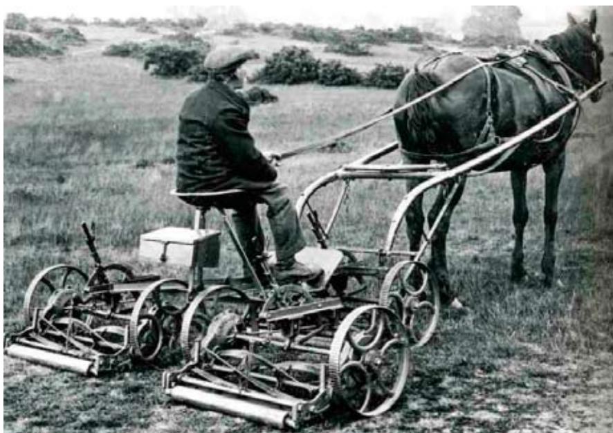
Triple gang circa 1923: Slow work for man and beast

Avoid top dressing outside the growing season