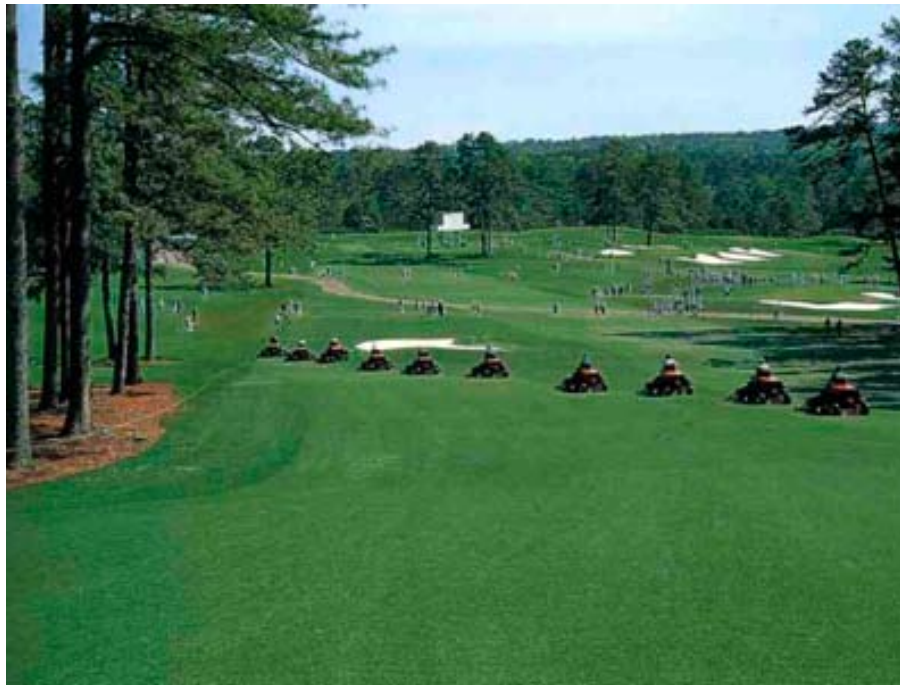
At Augusta, a platoon of greenkeepers cut fairways with triplex mowers, traveling in echelon