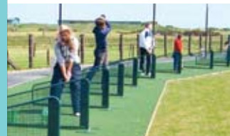
Huxley Practice Tee at St Andrews Links

Huxley Golf PREMIER ALL-WEATHER SURFACES FOR GOLF