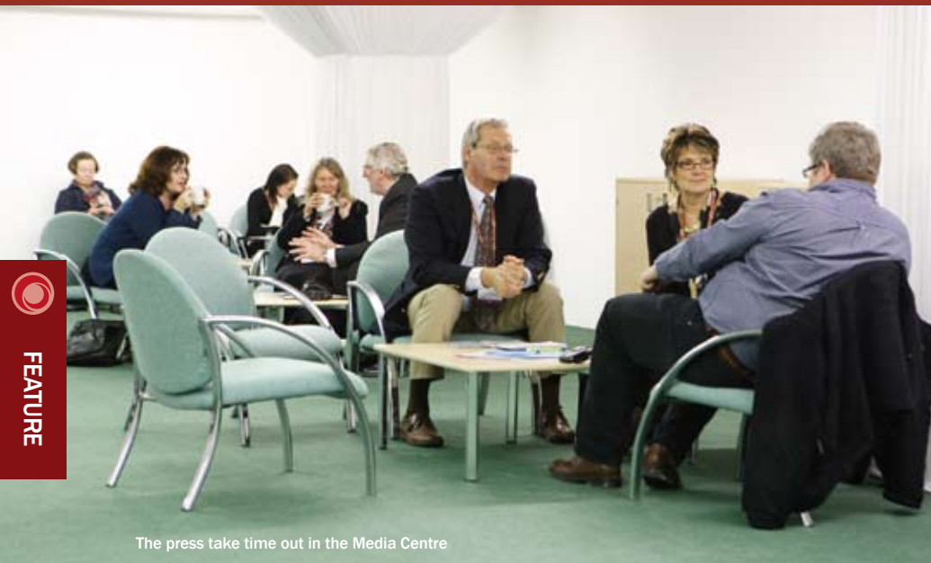
The press take time out in the Media Centre