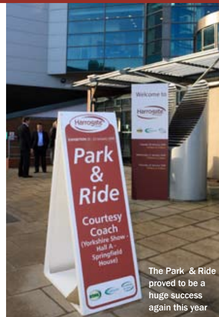
The Park & Ride proved to be a huge success again this year