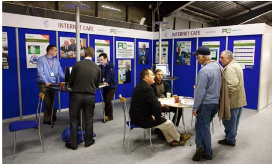
Keeping in touch

Wednesday is always the busiest day of the three and this year was no exception. With four halls in operation rather than the five in the alternate years the visitors are more compacted and it certainly helps to generate a superb atmosphere.