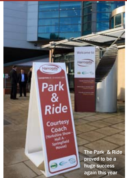
The Park & Ride proved to be a huge success again this year