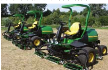
A turbocharged 36hp engine powers the 7000 Series, with a turbocharged and intercooled 42hp unit driving the 8500.

The mid-chassis 3020 compact tractor series are now offered with 'drive-over' decks.