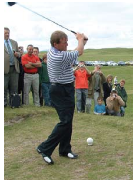
Kenny Dalglish drives in.