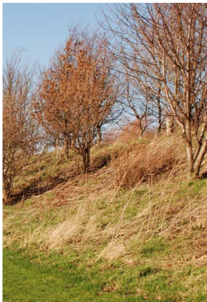
The massive mounding, together with the trees, offers great privacy to the course

“In fact we could have made more money than we did but for tax purposes it was not appropriate. In fact we used outside contractors for the landscaping work as it could be claimed back against tax whereas if it had been done in-house we wouldn’t have had any tax benefits.”