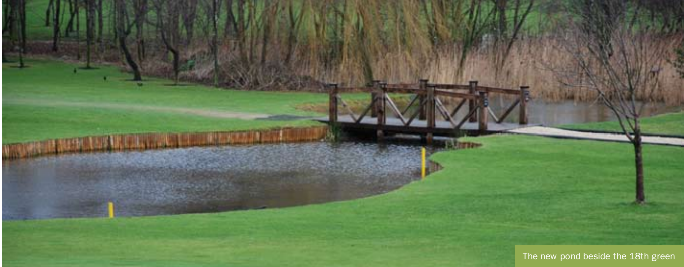
The new pond beside the 18th green