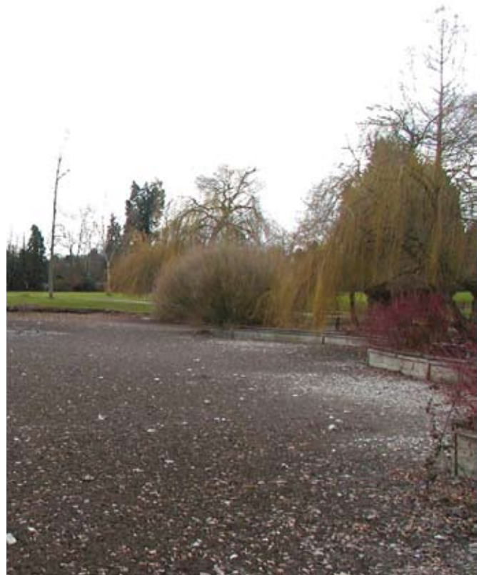
Orpington Pond, Kent, 2006