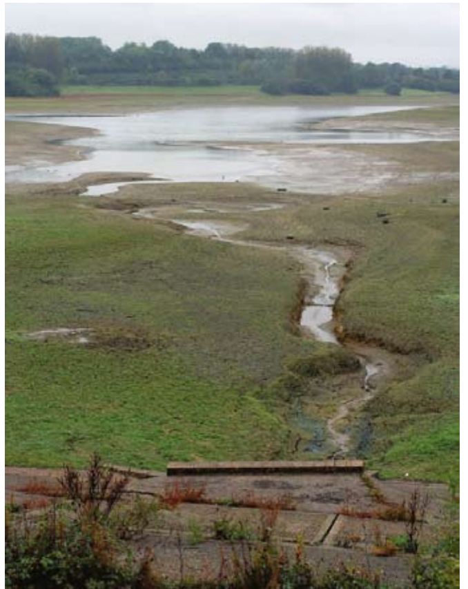
Bewl Reservoir, 2006