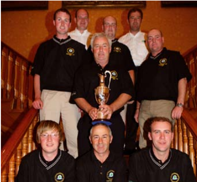
The winning Southeast team