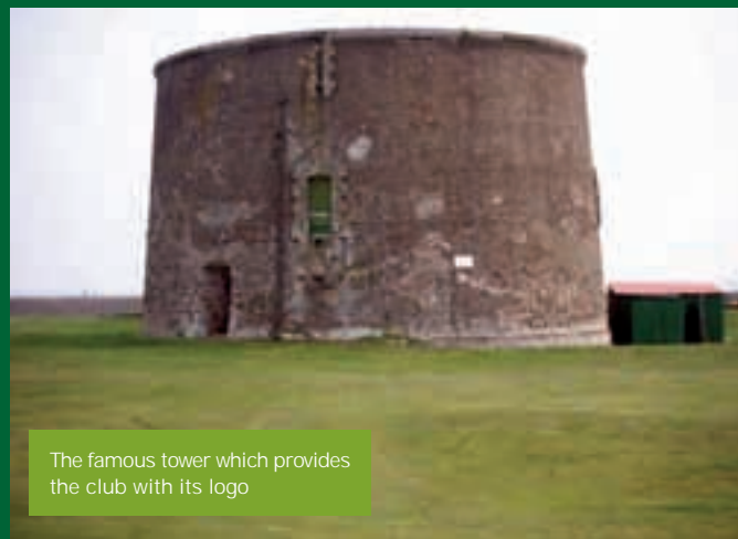
The famous tower which provides the club with its logo