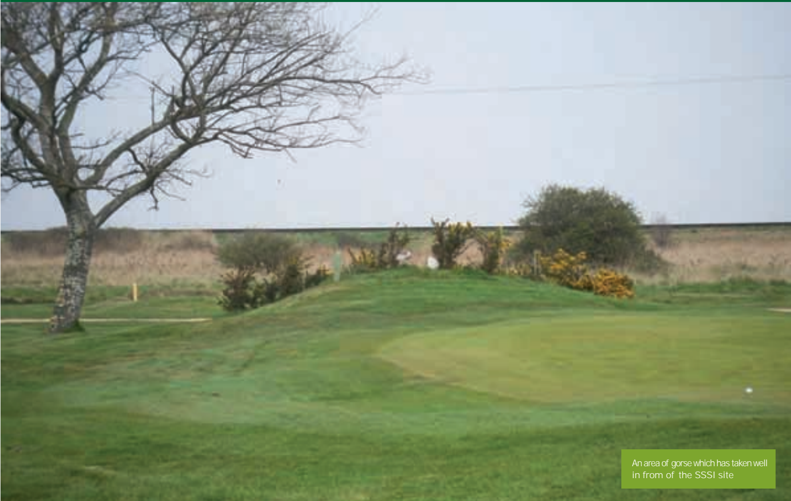
An area of gorse which has taken well in from of the SSSI site

Scott MacCallum travelled to East Anglia to visit an old club with some new and fresh thinking.