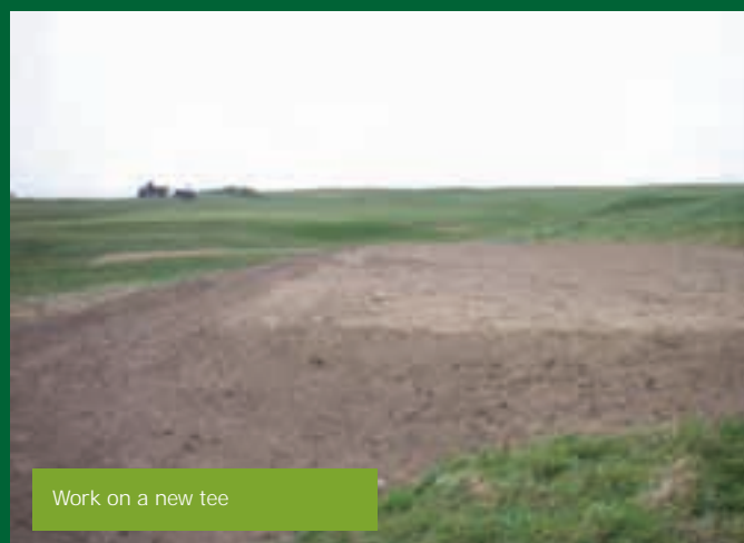
Work on a new tee