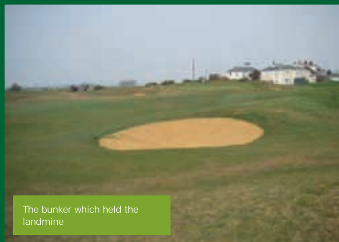
The bunker which held the landmine