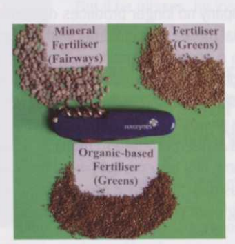
36 Organic Fertilisers