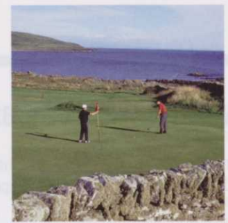
18 Course Feature