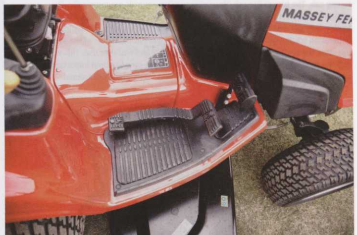
Massey Ferguson is a name many will associate with yellow MF135 based highway tractors, a good number of these once ubiquitous tractors being pressed into service with a set of gangs for fairway mowing. The company now offers a broad range of kit targeting the ride-on mowing market, with a comprehensive range of small tractors to suit golf users. Although its ride-on mowers includes models manufactured by US based MTD, Massey is a stickler for good operator comfort, with an eye for ergonomic detailing. Take this hydrostatic control pedal on its MF 22-28GC. A long pedal like this allows heel and toe operation, a design some prefer to side by side pedals. Again, details like this are easily overlooked when buying

It's a small change such as this that can make all the difference. So when it next comes to looking at a new tractor, do not rule out a given model because it essentially seems pretty much the same as the 10 year old example you are seeking to replace. The chances are the odd ergonomic nip and tuck will make the latest version more pleasant to operate.