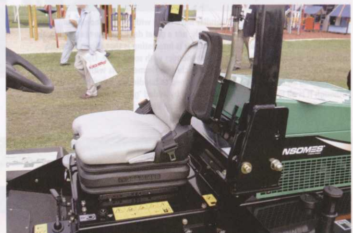
Seating remains something of a hot topic among operators; manufacturers sometimes offer a choice of seat but not necessarily with attractive enough pricing to tempt buyers to select the 'deluxe' option. Ransomes began to offer an air suspended seat as an option on its Highway models early this year. The value of this type of springing is not so much in added comfort but in the way the suspension automatically compensates for different operator weights. This is a real bonus on machines that may be operated by several different people. Fairway mowers will not really benefit from advanced suspension systems, but a seat that offers a good range of adjustment and support for the lower back is important. Larger tractors are offered with heated seats, an option that many would appreciate when mowing on a chilly morning