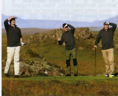
Ransomes Jacobsen and their local distributor MHG of Reykjavik, sponsored the Icelandic

Greenkeepers Association's annual golf tournament, held at Golfklubbur Kidjaberg, 90 miles northwest of the island's capital.