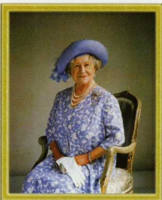
The Queen Mother was Patron of Sunningdale Ladies

In 1972 the course underwent a reconfiguration due to the lady members having to move out of their clubhouse and build a new one.