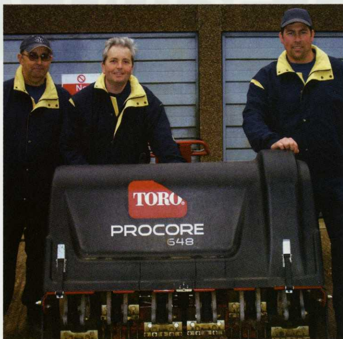
The greenstaff have named their fourth member of staff - the Procore – Bob

From time to time we have had people come and help over the summer – part time summer help, but not for the whole summer, a few weeks between their university studies and things.”