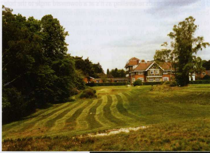
The smaller building to the left used to be the clubhouse before the club underwent its reconfiguration

"There's only ever been three full time greenkeeping staff here. One of the changes we were after and have been after for many years actually happened about two years ago, and we were able to get a fourth man. Unfortunately just over a year after that we had one greenkeeper leave and move on, and we were back down to three. We then needed a new piece of equipment so the fourth greenkeeper never got re-employed."