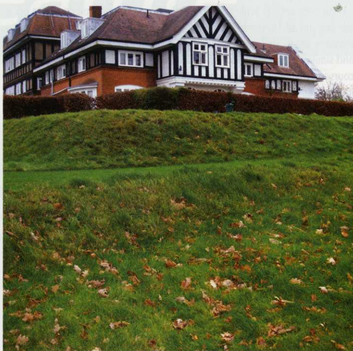
Two air raid shelters lie under this beautiful heathland course.

“It was a slightly harder year for us because of the weather but it was a god send that we still had water so we could still carry on and use it the same as we ever did – I mean we don't use colossal amounts of water anyway, because