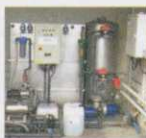
The ENZYMATIC15 wash water recycler. Designed & built in the UK by ByWater

Tel: 01530 833469 Fax: 01530 810795 Email: sales@bywaterservices.co.uk Web: www.bywaterservices.co.uk