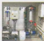
The ENZYMATIC15 wash water recycler. Designed & built in the UK by ByWater

Tel: 01530 833469 Fax: 01530 810795 Email: sales@bywaterservices.co.uk Web: www.bywaterservices.co.uk