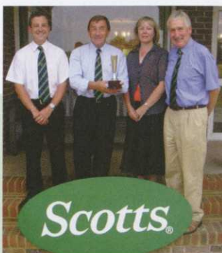
Winners: the Mid Herts GC team at Verulam GC.

The 2006 Midland Region Golf Management Trophy days, sponsored for the ninth successive year by Scotts UK Professional, were held at Verulam GC on July 27 and Boston GC on August 9. At Verulam, 20 teams from golf clubs had entered and at Boston 16 teams played. The competition is keenly contested for the Scotts Trophy, £200 worth of Scotts products to the winning golf club plus individual prizes for the first three placed teams. The format is four man teams, comprising a greenkeeper who is a member of BIGGA and three golf club officials playing a Stableford, with the best two scores on each hole to count - and has proved a popular event. The winning team at Verulam GC with 83 points was Mid Herts GC, who won on a countback from Ellesborough GC. Berkhamsted GC were 3rd