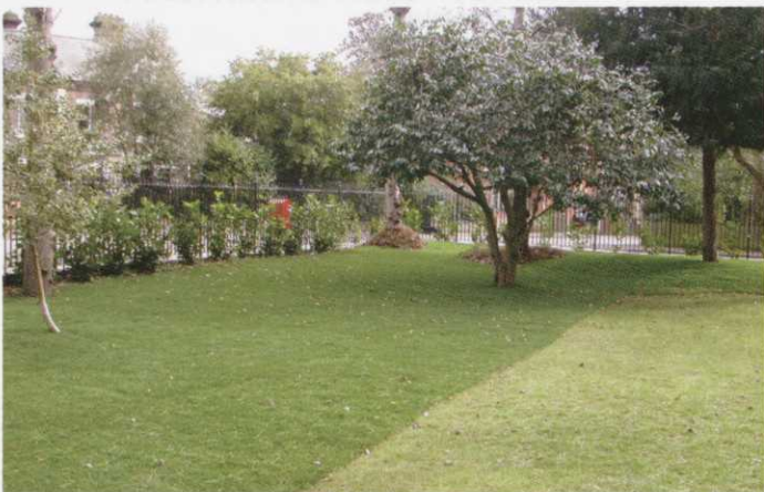
The residents of this development in Colchester are absolutely delighted with their new RTF turf

For further information on BAR 10 with RTF or a copy of the free RTF brochure call: 01359 272000.