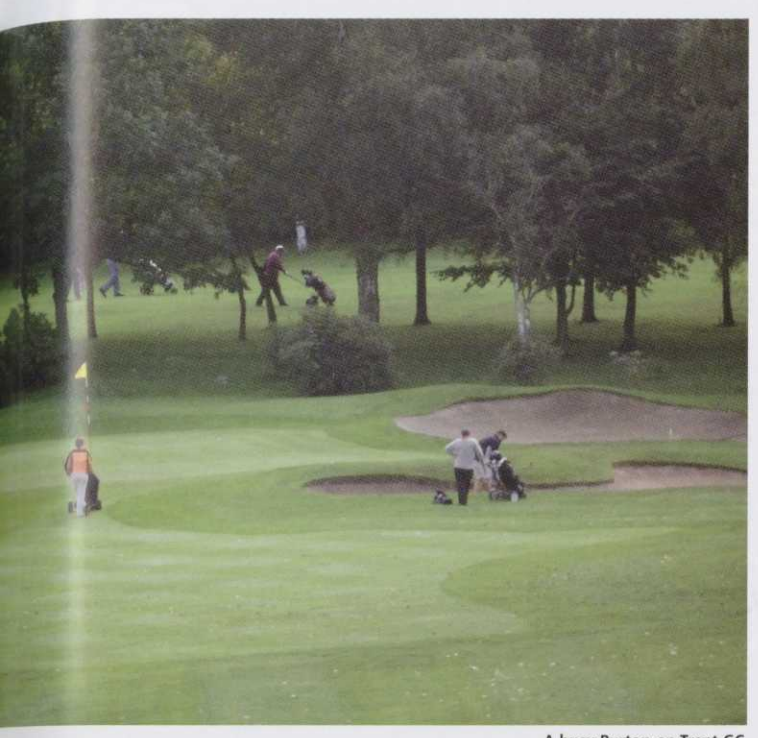
A busy Burton-on-Trent GC