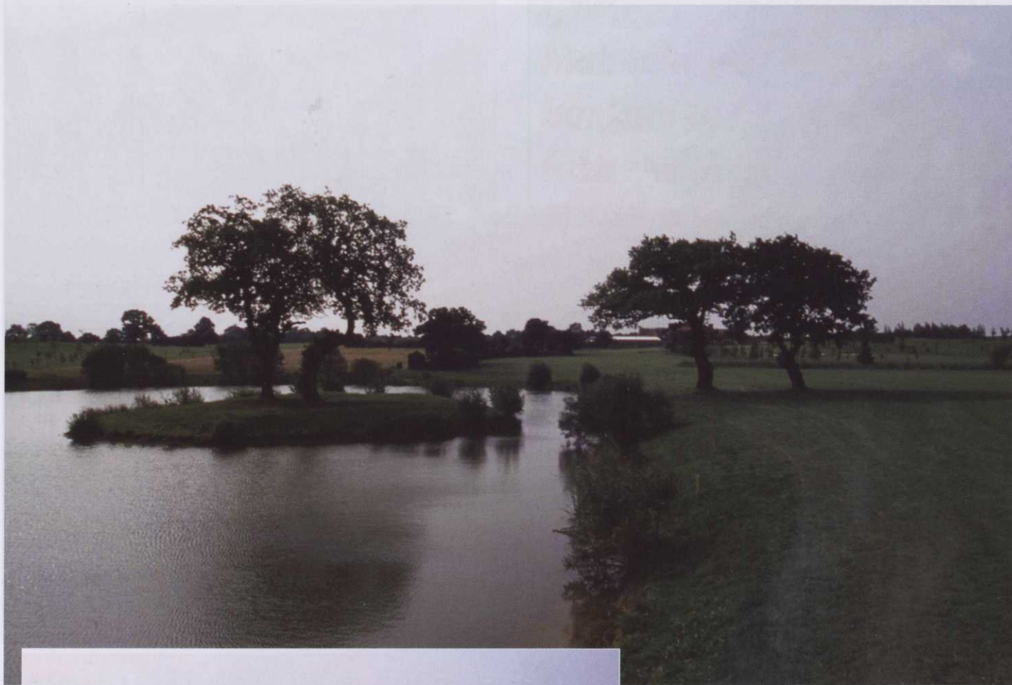
Watch the water on Stock's 9th