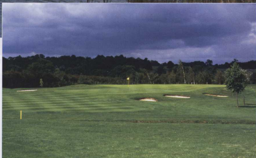
The opening hole on the Stock course, a harsh wind makes it a tough start