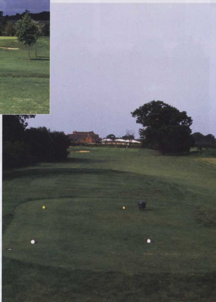
The tee shot on the 15th, out of bounds runs along the right of the fairway