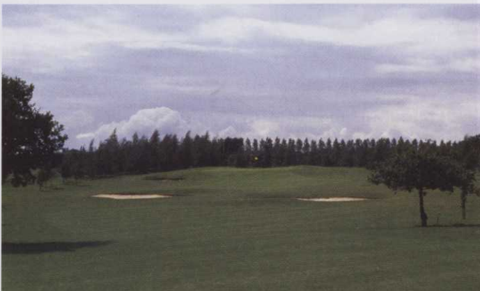
Stock's 5th hole is a long par 5