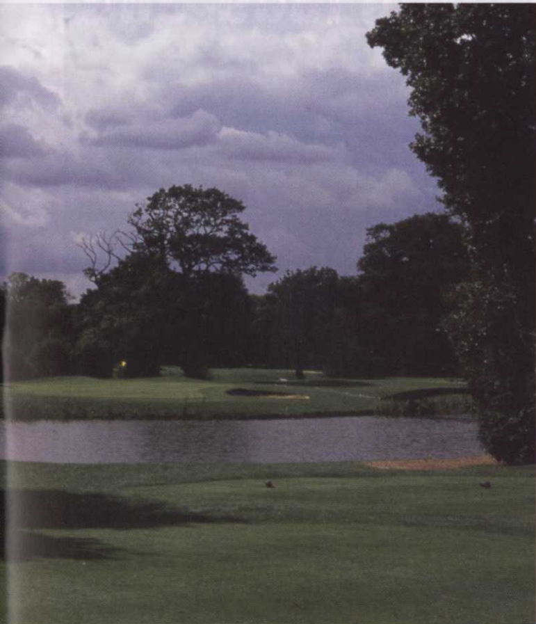
The Stock 4th offers a beautiful but challenging tee shot