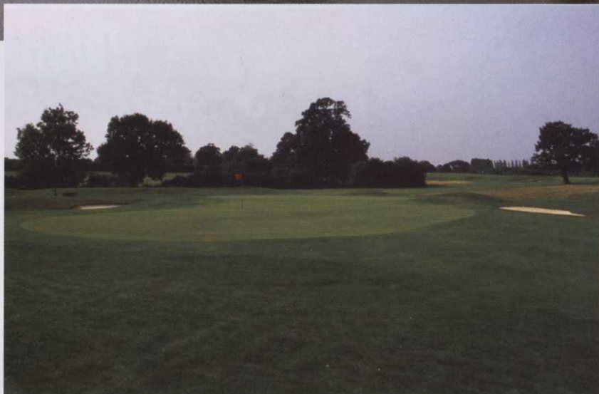
An accurate drive is needed on the 14th to avoid the trees