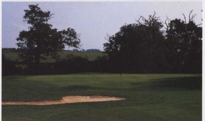
The 12th green on the Brook Course